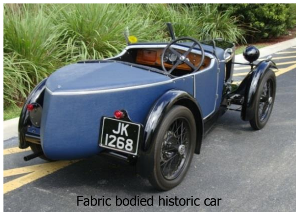
Fabric bodied historic car

The Federation appreciates that great progress has been made in sensors and software technology in motor vehicles. However, it also notes that the question above has arisen because limitations in ALKS equipment sensor capabilities have been highlighted at paragraph 3.34 of the Document. Whilst the limitation relating to the ability of the equipment to “look” upwards to signage on gantries is not the specific concern of the Federation, it does raise doubts about sensing capabilities in general. If those sensors and the related software cannot cope with such a routine event, the Federation is concerned that the equipment may have other limitations which could pose a risk to historic vehicles.